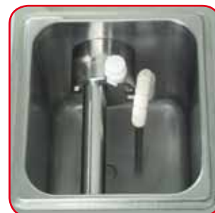
Directly refrigerated tank