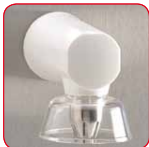
Stainless steel spout