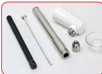
Removable components of the dispensing nozzle for perfect cleaning