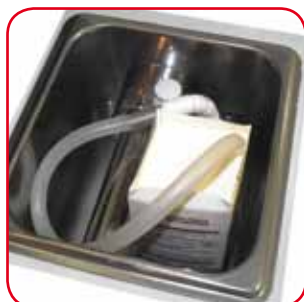
It is possible to directly connect the cream packaging to the pump